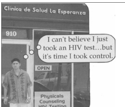
Scene from fotonovela Rude Awakening / Un Cruel Despertar

In creating these fotonovelas, FJF promotores took pains to ensure that they were culturally and linguistically