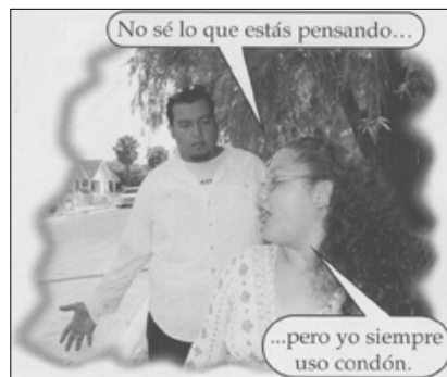
Scene from fotonovela The Gift of a Lifetime / El Regalo de Toda Una Vida

appropriate, easy to read with visual appeal, and had a clear educational message. The stories touch on issues such as substance abuse, condom use, fear of disclosing same sex orientation, and stigma. Their prevention message are aimed at both individuals who are HIV infected and uninfected.